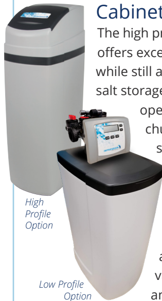
High Profile Option

The low profile option allows full access to the control valve for programming and servicing without having to remove the cover.